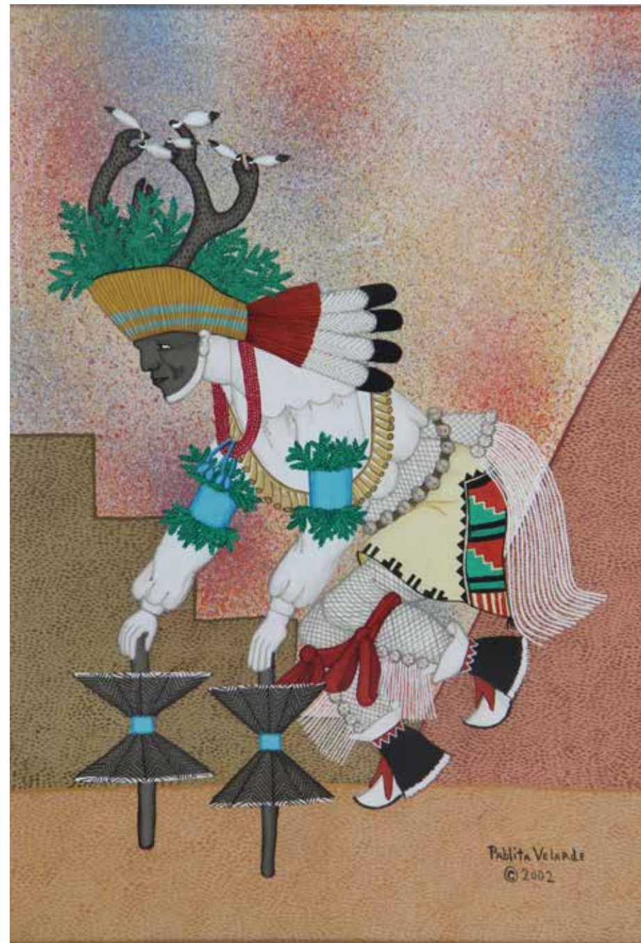
Pablita Velarde "Deer Dancer" 14" X 10" casein watercolor (1 of last 3 paintings done by Pablita) 2002/5 $14,500