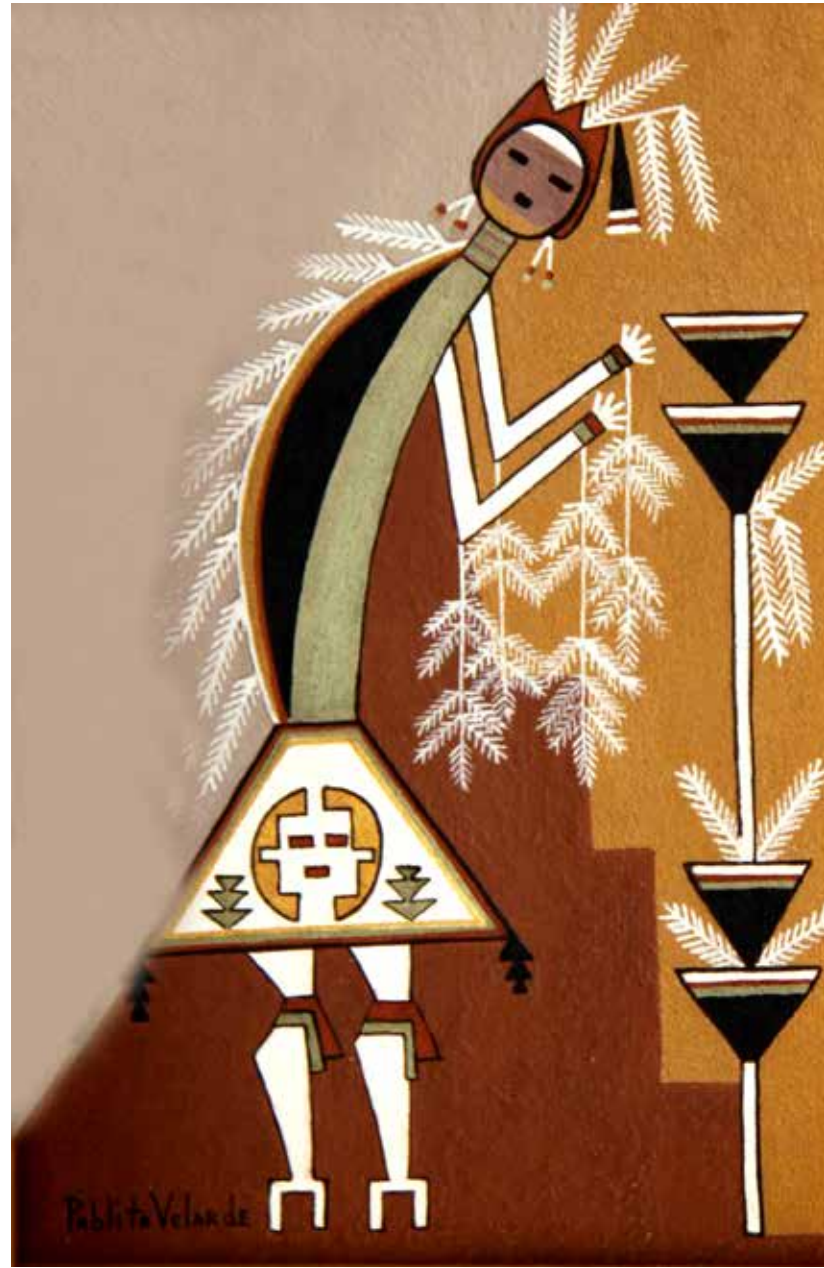
Pablita Velarde "Yei" 11" X 7" earth pigments c.1970 $7,500