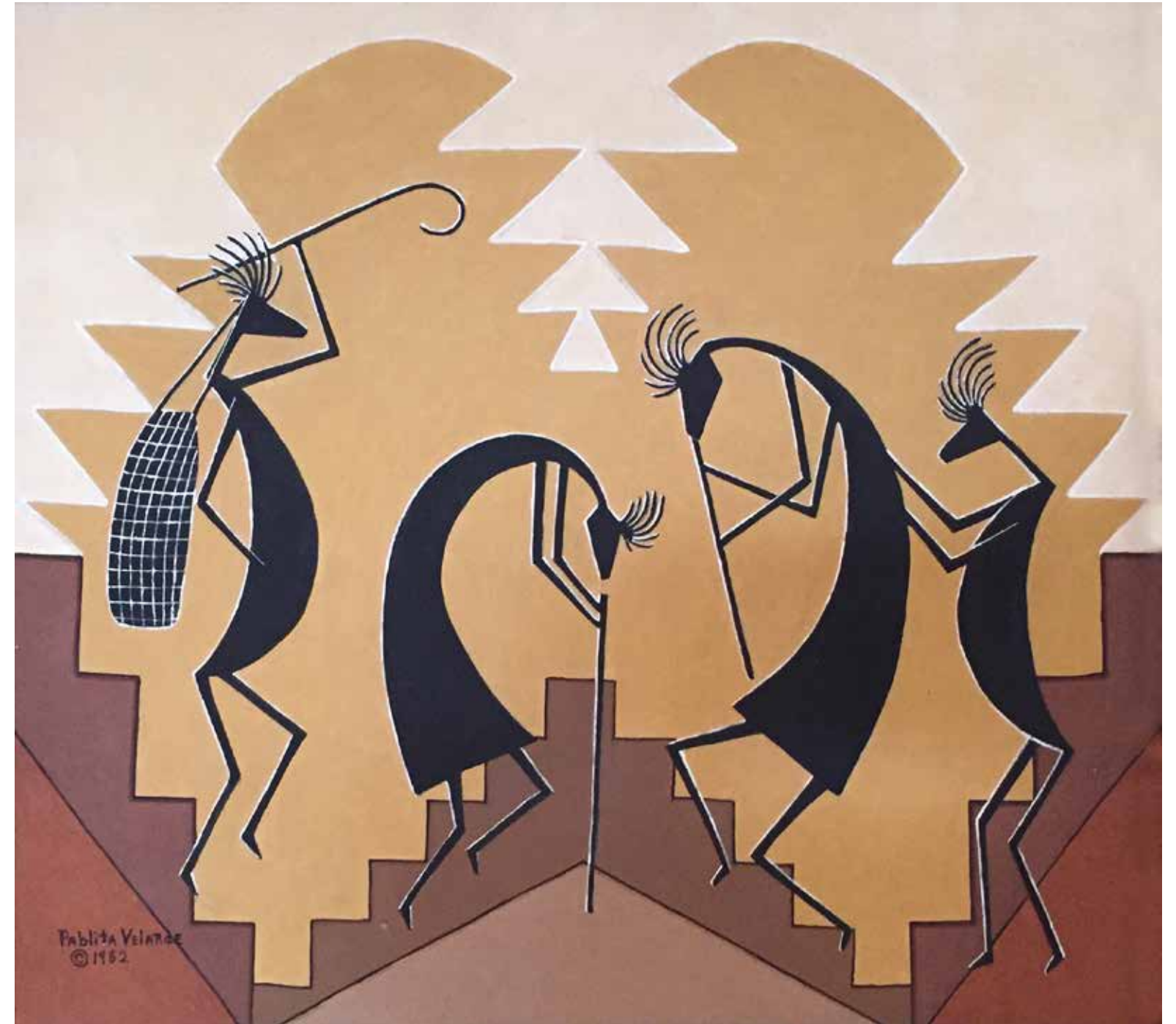
Pablita Velarde "Concert of the Hohokam" 18" X 20" earth pigment 1982