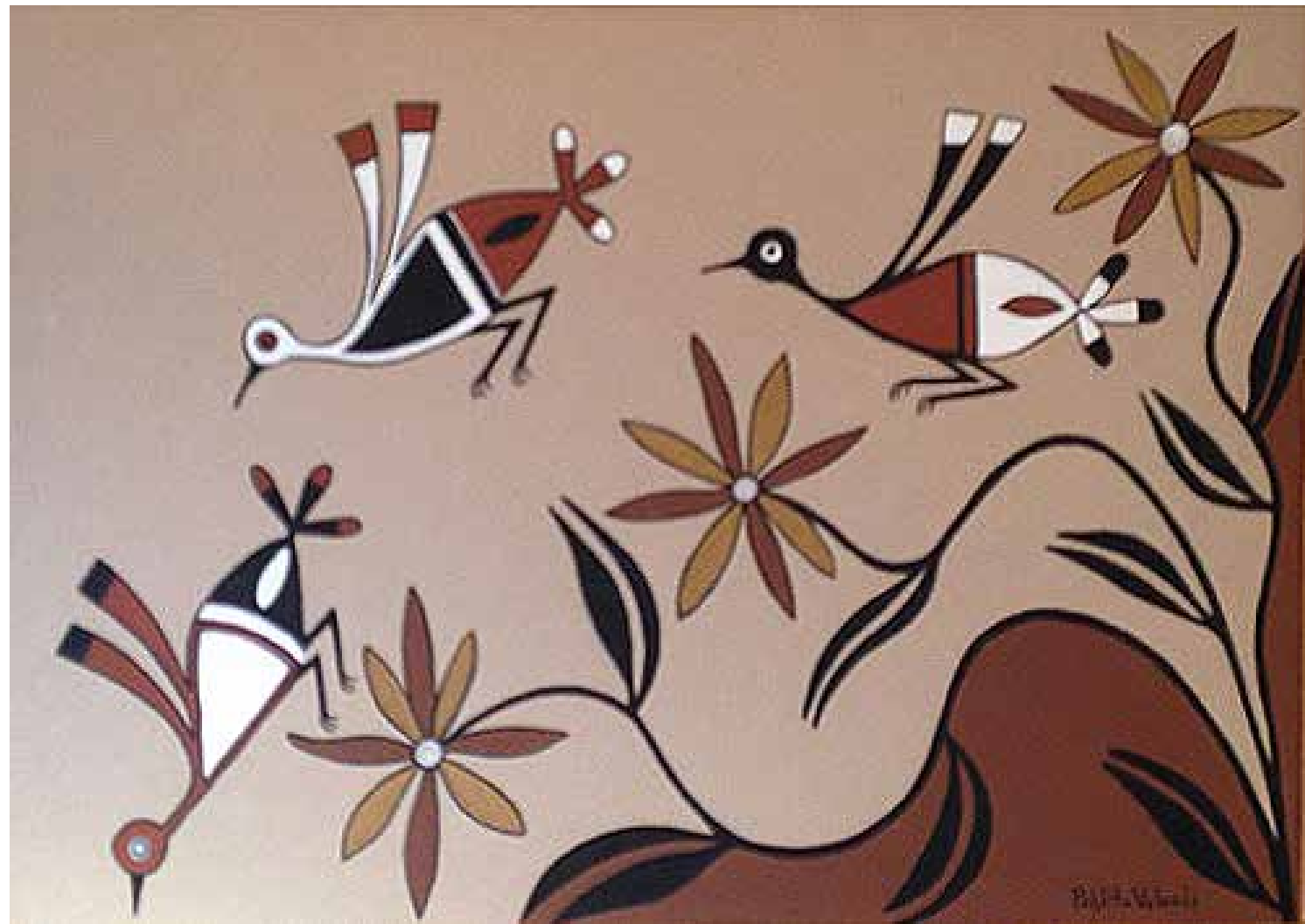
Pablita Velarde "Humming Birds" 15" X 21" earth pigment c.1970 $13,500