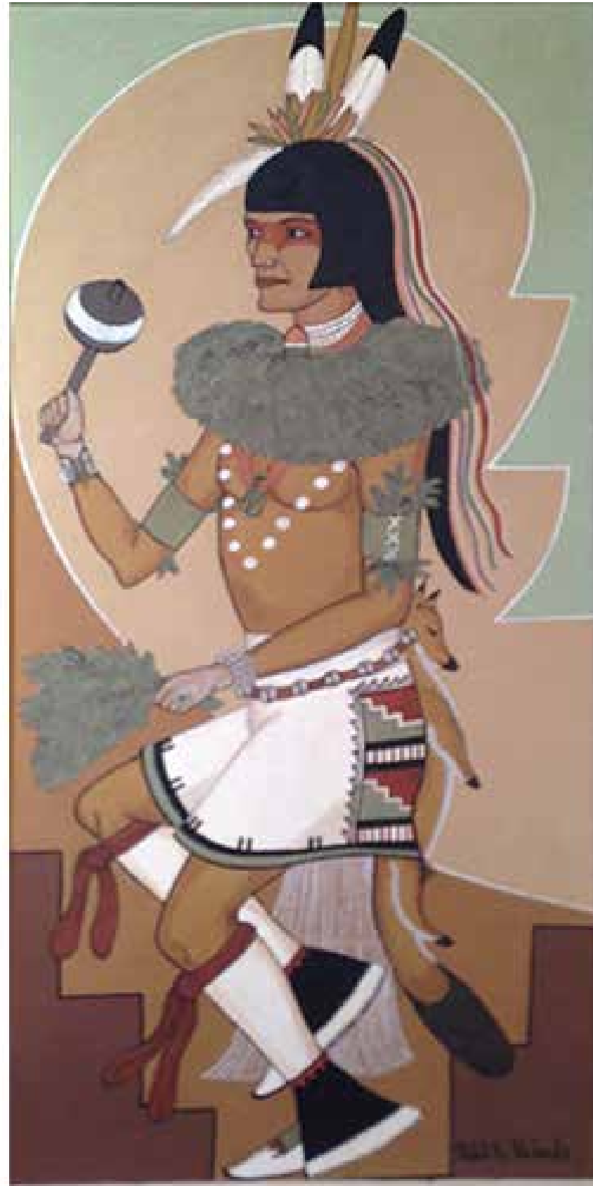
Pablita Velarde "Matched Pair of Dancers" each 24" X 12" earth pigment c.1965 $14,000 special pair pricing