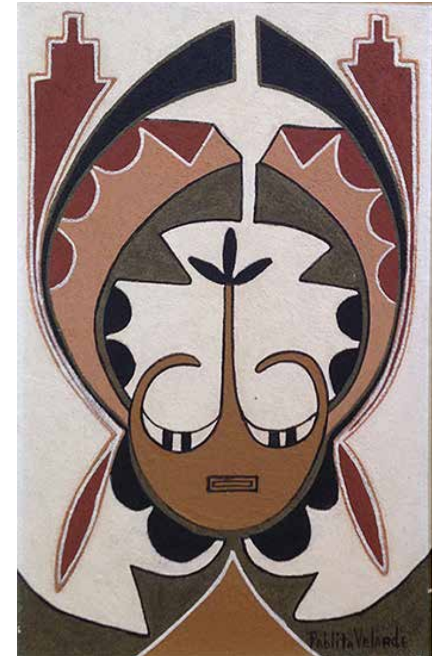
Pablita Velarde "Abstract" 11" X 9.5" earth pigment c.1965 $7,500