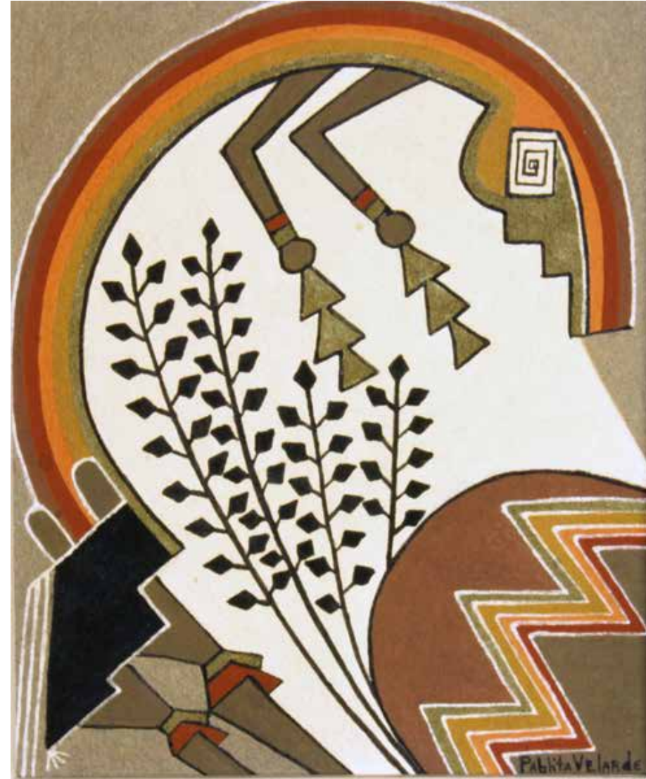
Pablita Velarde "Rainbow Yei" 8.5" X 11.5" earth pigment c.1965 $7,500