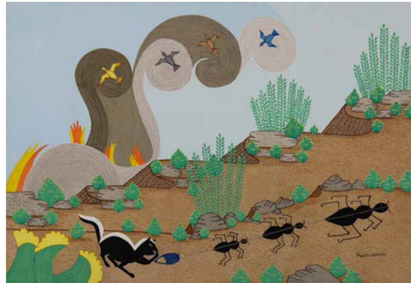
Pablita Velarde "How The Skunk Got It's Scent" 15" X 22" casein watercolor c.1967 $22,500