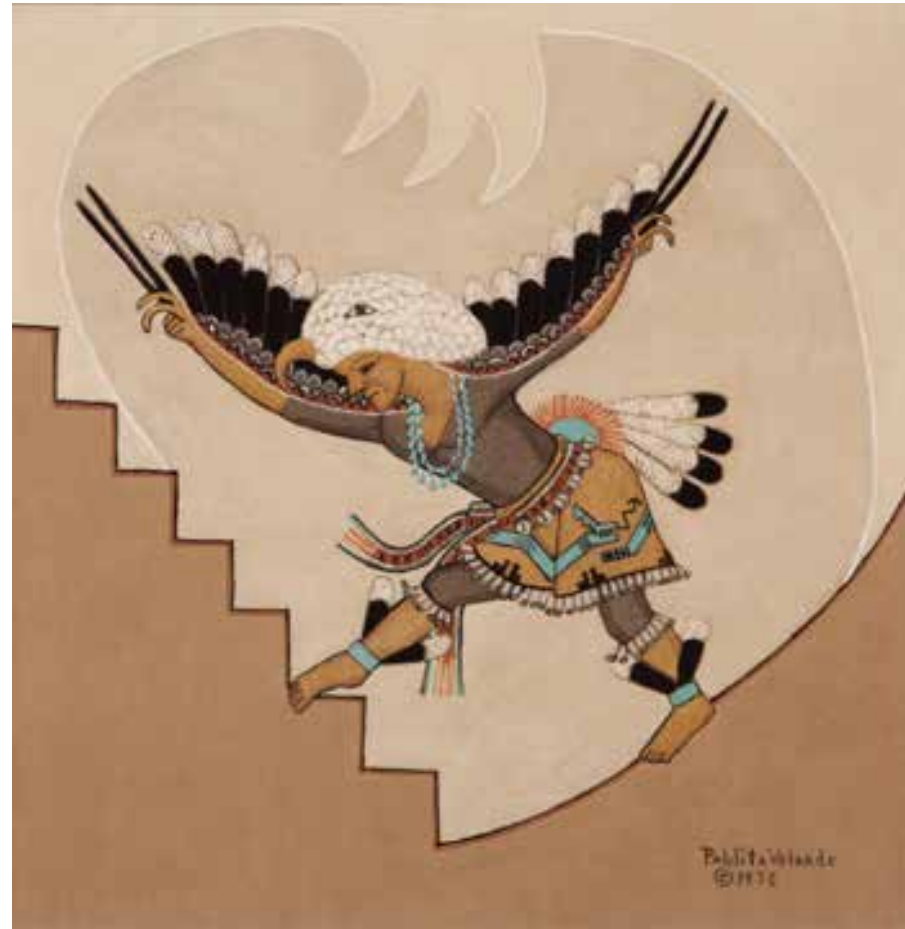
Pablita Velarde "Eagle Dancer" 11" X 11" earth pigment 1978 $7,500