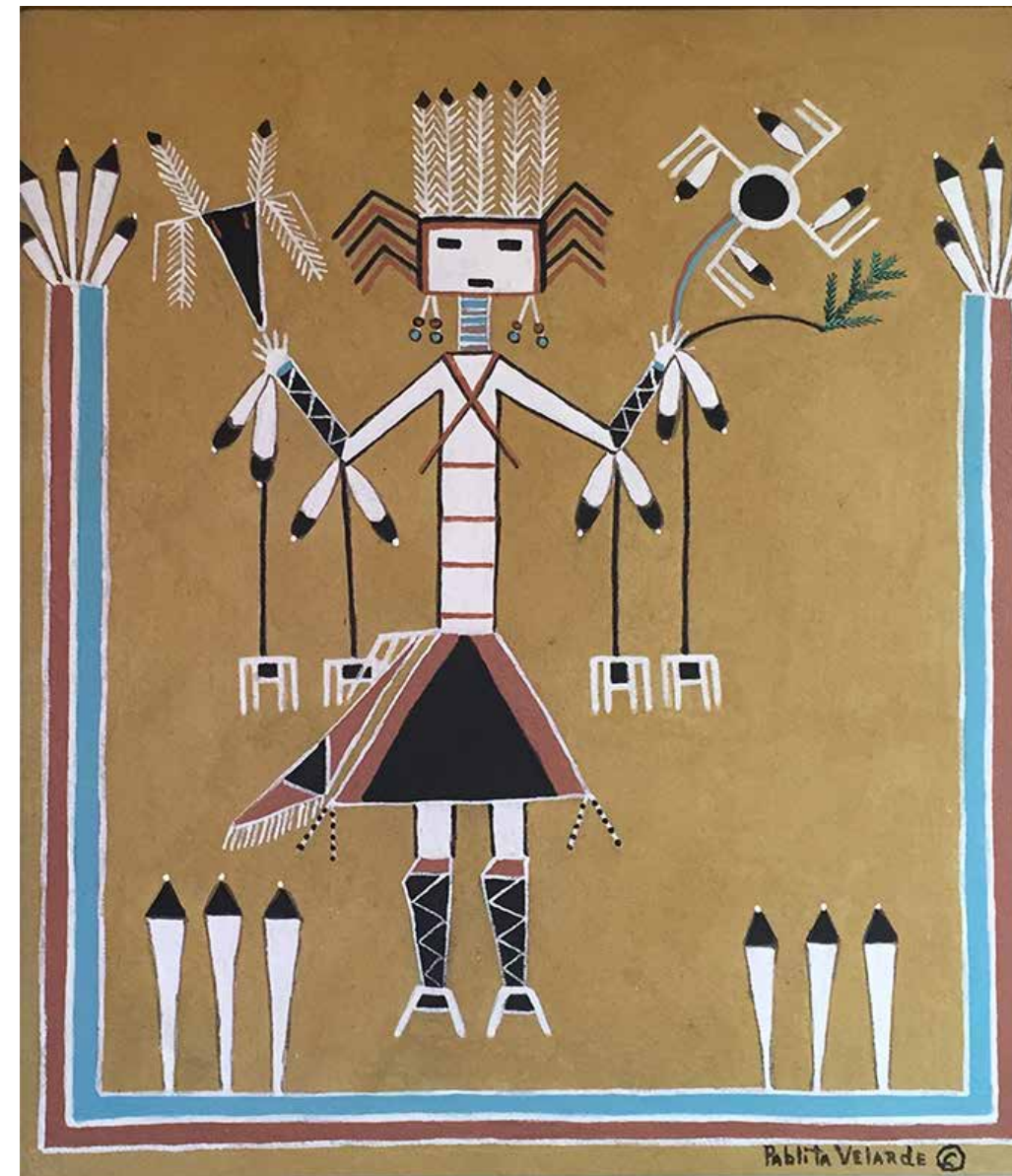
Pablita Velarde "Morning Mist Yei" 11" X 9.5" earth pigment c.1977 $7,500