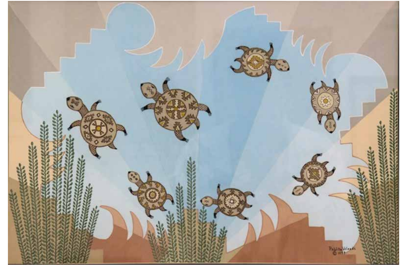
Pablita Velarde "Mimbres Turtles" 15" X 20" casein watercolor 1979 $22,500