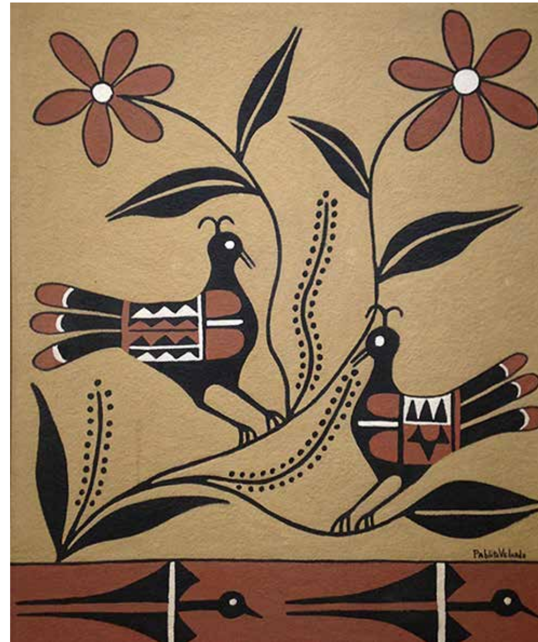
Pablita Velarde "Pueblo Birds" 24" X 20" earth pigment c.1960 $19,500