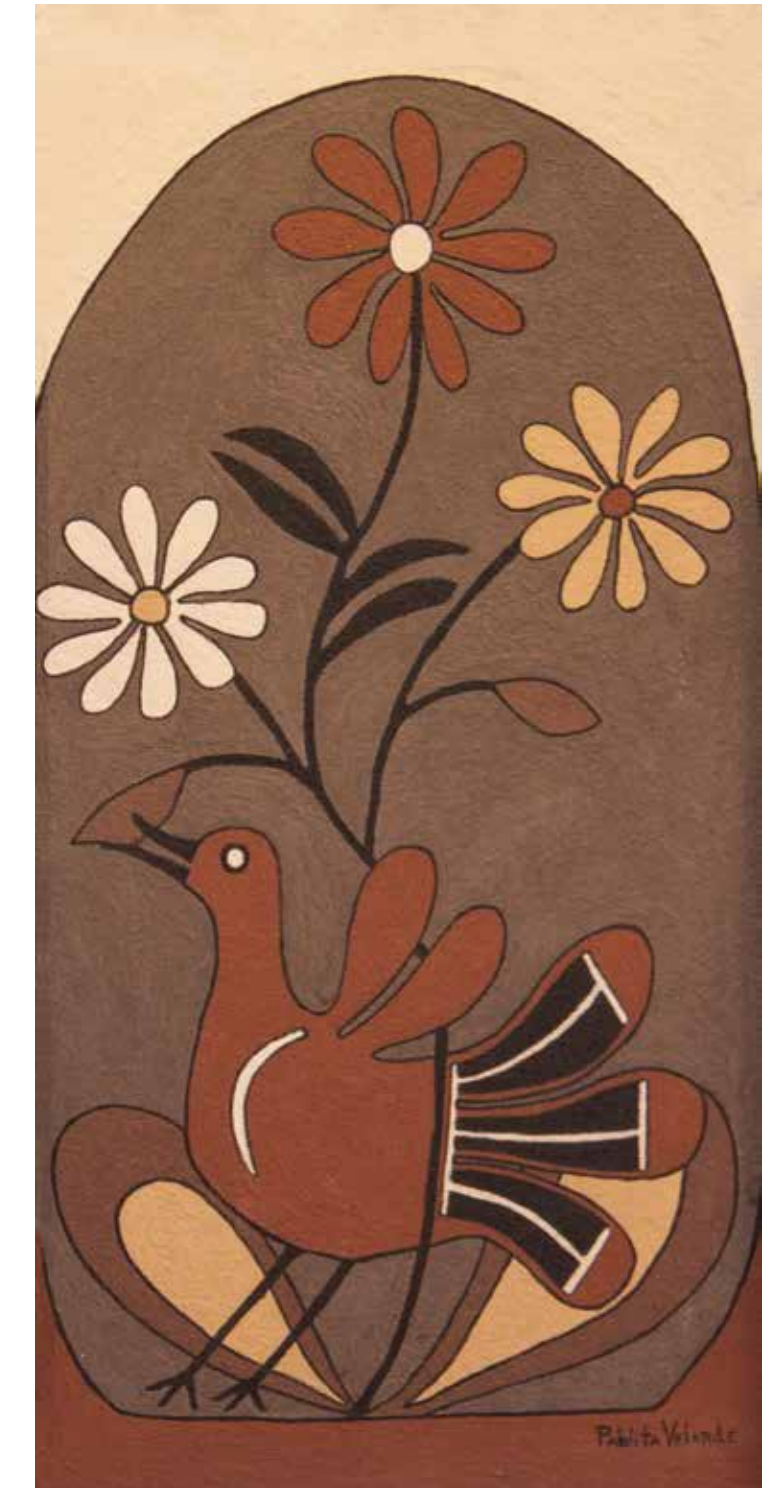
Pablita Velarde "Santo Domingo Bird" 24" X 12" earth pigment c.1952 $12,500