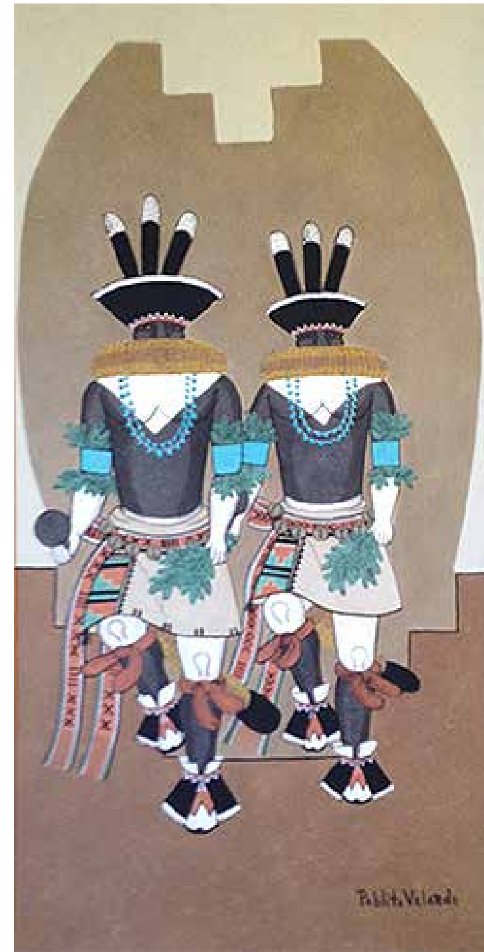
Pablita Velarde "Sheep Dancers" 20" X 10" earth pigment c.1973 $10,500