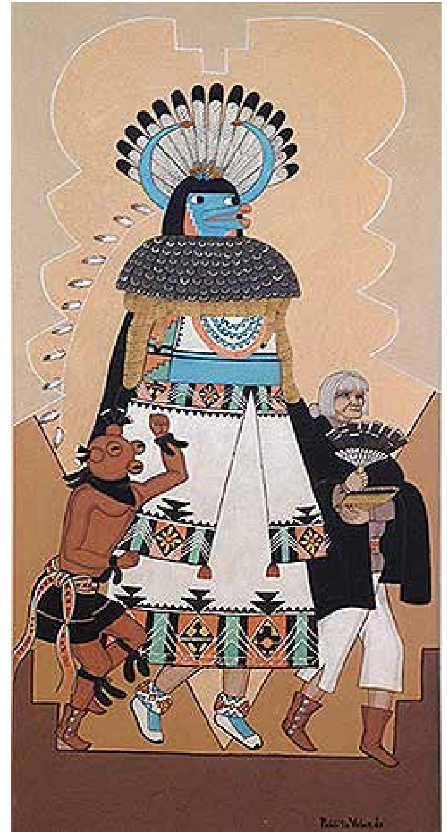
Pablita Velarde "Shalako" 24" X 12" earth pigment c.1970 $12,500