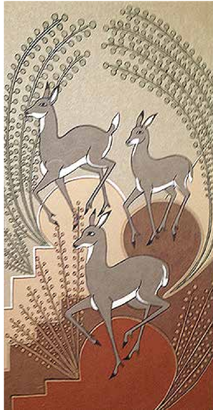
Pablita Velarde "Three Deer" 25" X 13.5" earth pigment c.1960 12,000