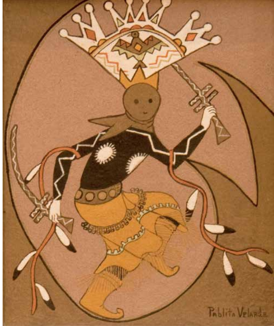
Pablita Velarde "Apache Devil Dancer" 11" X 9.5" earth pigment c.1965 $7,500